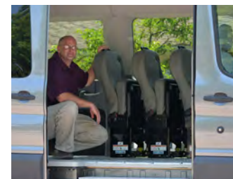
(AbiliTrax revolutionary FMVSS seating solutions allow for any configurations at any time)

OLW, located in the greater Akron / Cleveland, OH area is a private nonprofit that provides residential, transportation and day programming services for 950 children and adults with developmental disabilities located throughout 45 communities in Northeast Ohio. "My stance at OLW is, unless it has AbiliTrax in it, I will not buy it...every wheelchair lift van I purchase must be AbiliTrax upfitted"