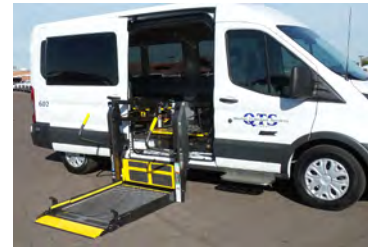
(QTS provides transportation services to hospitals, assisted living facilities, nursing homes and hospices throughout Arizona)