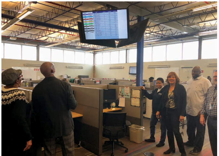
The SCR management team uses state-of-the-art fleet monitoring systems that allow them to track their paratransit fleet’s performance in real-time.

AbiliTrax is a unique modular flooring platform that features a versatile “X” track system, allowing vehicle capabilities to