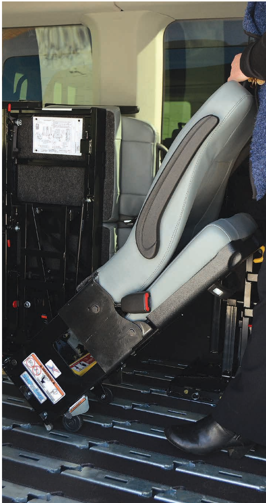
AbiliTrax provides drivers with a much more user-friendly environment when they are changing seating configurations. By the driver simply using their foot, AbiliTrax allows for "hands free" latching and unlatching of the "Step-N-Lock" seat base.