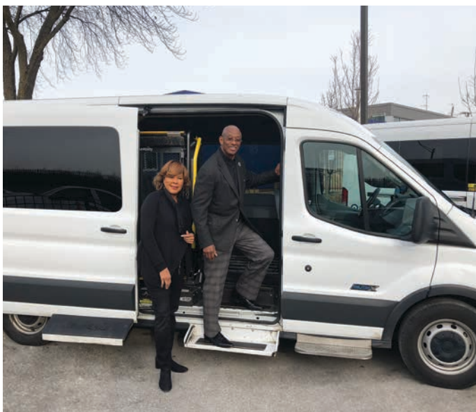
With the AbiliTrax Shift N Step system, the paratransit operator can now use the safer curbside location for both wheelchair and ambulatory access.

leadership in patent protection and overall product distribution. And we've already received several patents on various designs within our product line, and have several more in the patent pending stage," Fenton said.