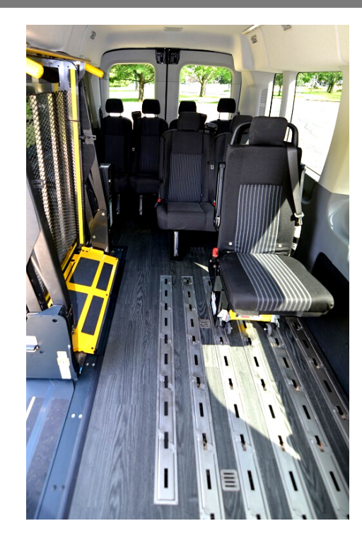
*Shown photographed in Manor Oak

Choose from full length AbiliTrax flooring, partial integration with your Ford OEM floor or upgrade to Manor Oak or Heritage Maple Vinyl floor finishes